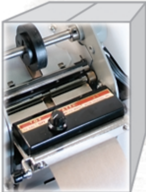
Top Heater enhances the effectiveness of adhesive for a better bond with carton