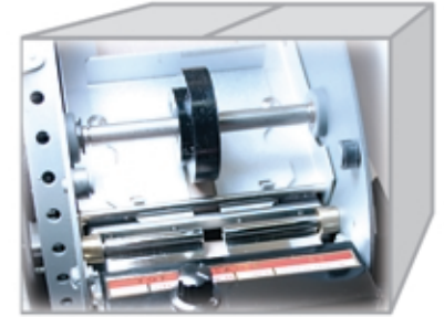
Unique Urethane Feedwheel for clean cuts and long life