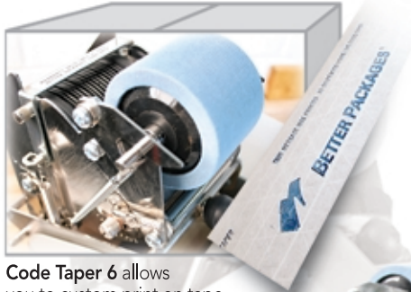
Code Taper 6 allows you to custom print on tape

location – or it can be kept in a fixed position of an industrial packaging department. Perfect for residential or commercial applications, the Better Pack 333 Plus is the best way to securely seal cartons by hand.