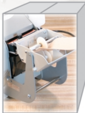
Tape Aerial allows you to handle tape more efficiently